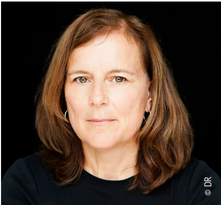
Hélène Blackburn Choreography, set & costume design